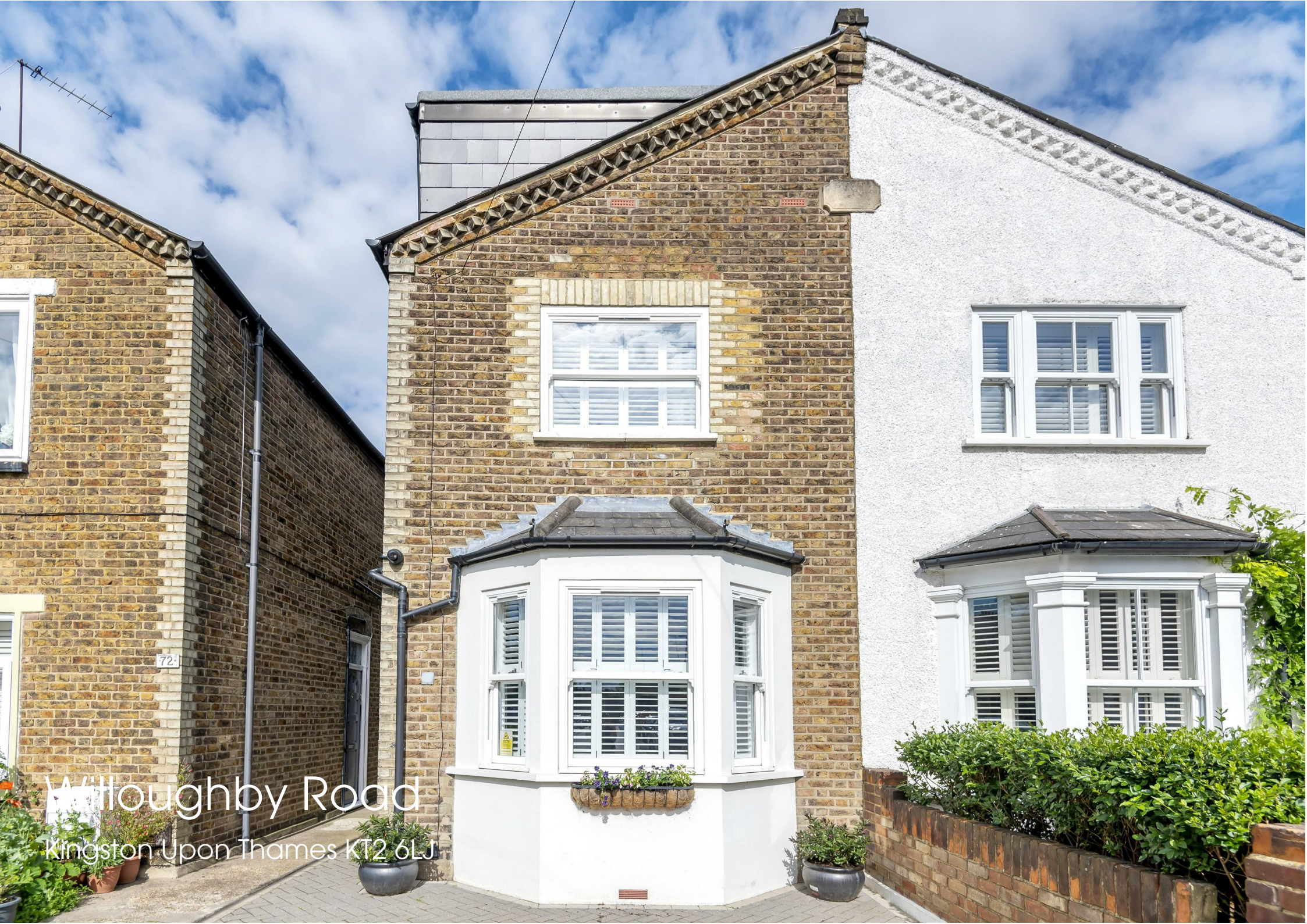
Willoughby Road Kingston Upon Thames KT2 6LJ

34 Richmond Road Kingston upon Thames Surrey KT2 5ED www.gibsonlane.co.uk Tel: 020 8546 5444